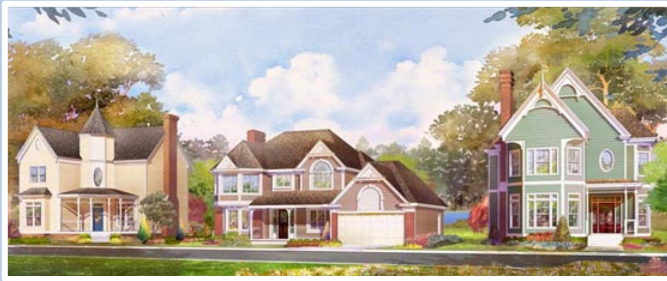
Single Family Cottages